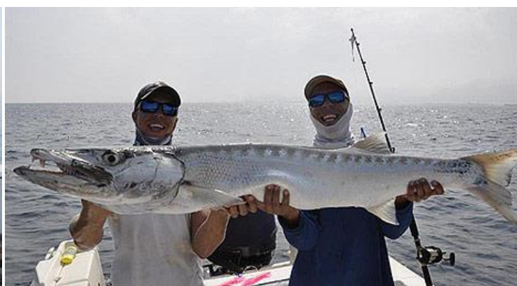
Giant barracuda during trolling

Our partner on site offers highly professional boats, equipment and guidance. It is therefore the best operator in this location. Fishing here is of a surprisingly good level. There are little other fishing charters and there is no commercial fishing with trawlers or longlines. You may come across some local fishermen but that is it.