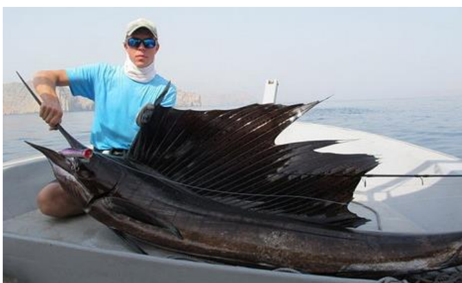
Giant sail on the popper

The Gulf of Oman has a very stable temperature. This ranges from 24°C to 33°C on average throughout the year. That is why the fish population has little variation during the year. Practically all species can be caught throughout the year. Dorado, bonito, tuna, dogtooth, barracuda, rainbow runner, cobia, barracuda, amberjack, dogtooth, wahoo, grouper, sailfish, jacks and marlin.