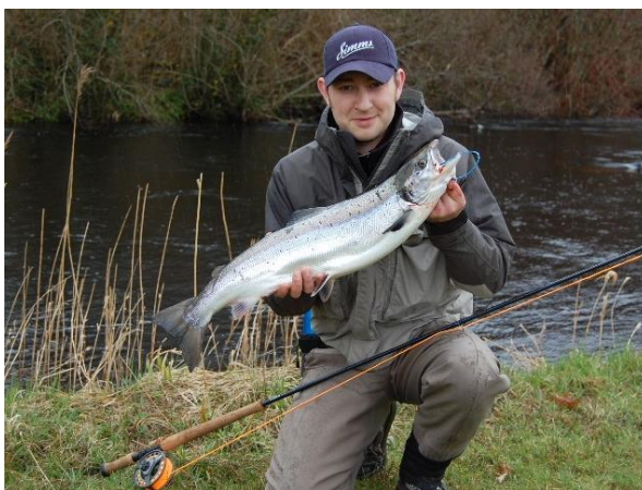
Salmon on the fly