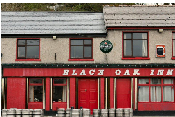
Black Oak Inn

local pubs. Anchor House, on the other hand, is more secluded, quieter and has more luxury and is situated directly on the Black Oak River and overlooking the harbour.