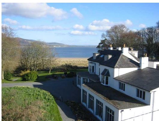
Fort Royal Hotel

Fort Royal Hotel: This is a very luxurious option to stay in this region. But at the same time it is of unprecedented beauty. Directly at the sea is the 15 room, 4 star Fort Royal Hotel. Provided with all the luxury you will not lack anything here.