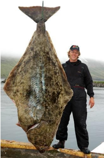
Halibut of 350 lbs.

The Icelanders are extremely careful with their fish stocks. It is against the law to return caught fish in Iceland. We should therefore not advise you to put the fish back if it is undamaged. More information will be provided locally by the guides.