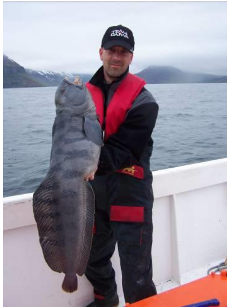
Wolf fish of 22 lbs.