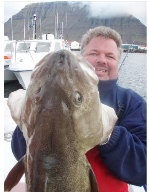
Cod of 62 lbs.