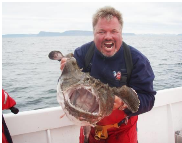
Monkfish of 38 pounds and a happy fisherman!

The large fjord in the middle of which Flateyri lies has an average depth of 20 meters. Here, too, flatfish can be fished from the boat jetty or harbour pier. This offers a nice change after a long day of "heavy" fishing at sea.