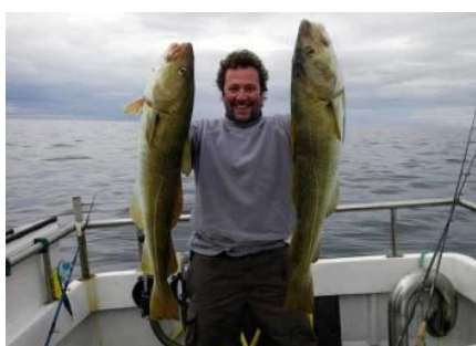
Typical Iceland cod