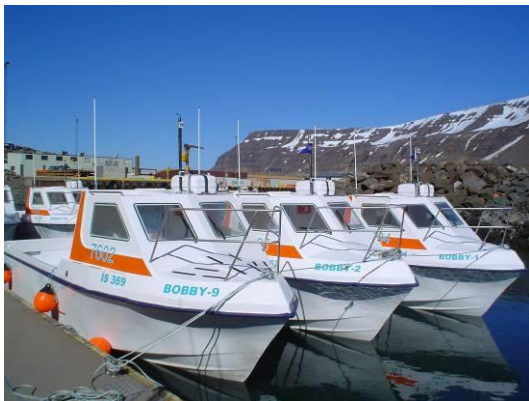
Top boats at almost 8 metres !