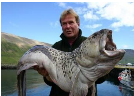
Giant spotted wolffish

Fishing with natural bait for wolf fish in depths of 15 to 25 meters and the medium pilk / jigging for cod in depths of 15 to 30 meters are promising and guaranteed to yield fish. The drifting fishing and jigging with heavy shads and fishing with large natural bait in depths of 20 to 50 meters has yielded the largest fish in recent seasons. Also try the drop off at the Isarfjord at depths of 80 to 100 meters here we found large schools of cod.