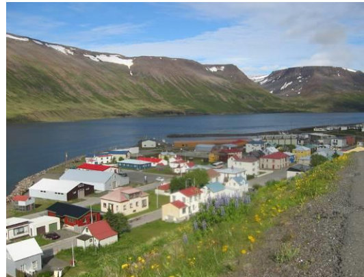
The fishing village Sudureyri in summer

Unfortunately, on the GPS equipment the pre-programmed waypoints are sometimes erased by "less experienced" guests. Please leave the basic setting as it is and only save new hotspots as waypoints.