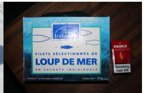
2 kg unit