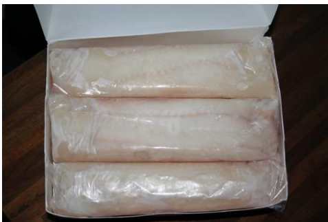
2 kg fish with single packed filets

If you have ordered a box of ready-to-eat fish, it is 20 kilos and you will receive it when you leave your hotel from Reykjavik on the last day. These professionally processed fillets are frozen at -18°C and this service ensures that you do not have to fillet them yourself. The package of fish is completely ready for the return journey. The fish is already packed frozen in a transport-safe thermo box to which only the sticker with destination needs to be affixed. The quantity of fish is generally divided among the following species: catfish, cod and coalfish. The distribution depends on the season.