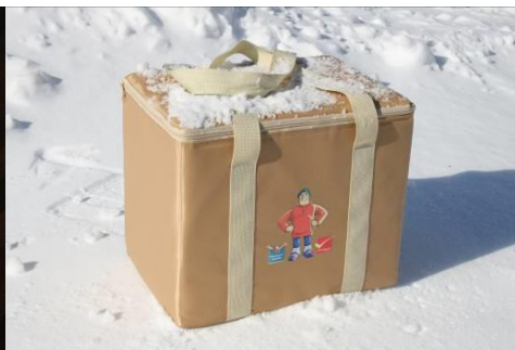
thermo bag with 20 kilo fish