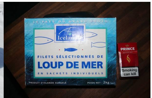
2 kg unit