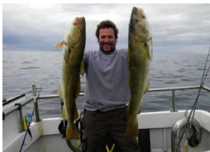
Typical Iceland cod