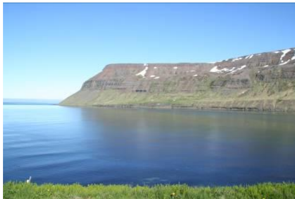
Fjord at Sudureyri