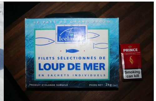
2 kg eenheid

In the past, the fishing package of 20 kilos per person was standard included in the price. However, many guests often found it too much or was inconvenient because of the maximum amount of luggage on the return journey. That is why there is the possibility to choose for the fishing package. Suppose you go with four people and you take two fishing packages then each has 10 kilos of fillet. In addition, it also makes a difference in the price that you as a customer eventually pay. The lesser costs per fish package of 20 kilos are € 200,-. So if you bring 1 package with 2 persons and share the content, it will save you both € 100,- in 2023.