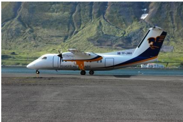
Charterplane at Isafjörður

For the domestic flight we have our own charter plane. We are therefore not dependent on any airline. Only if there are not enough anglers in a week we use Icelandair's scheduled flight. This sometimes happens at the beginning and at the end of the season. And only when the weather conditions do not allow us to fly, we use a bus coach to get you to your on location. Of course the domestic flight with only 50 minutes is much more comfortable than an 8 hour bus ride but we try to avoid this as much as possible. But in case of bad weather a solution is at hand.