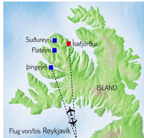
Flying route to Westfjord (Isafjörður)

In the apartments flat screen TV's are installed with satellite receivers and wireless internet is available free of charge. There are also drying rooms where the fishing overalls, rods and boots can be put away to dry, so you can step into a dry and warm suit / shoes the next day.