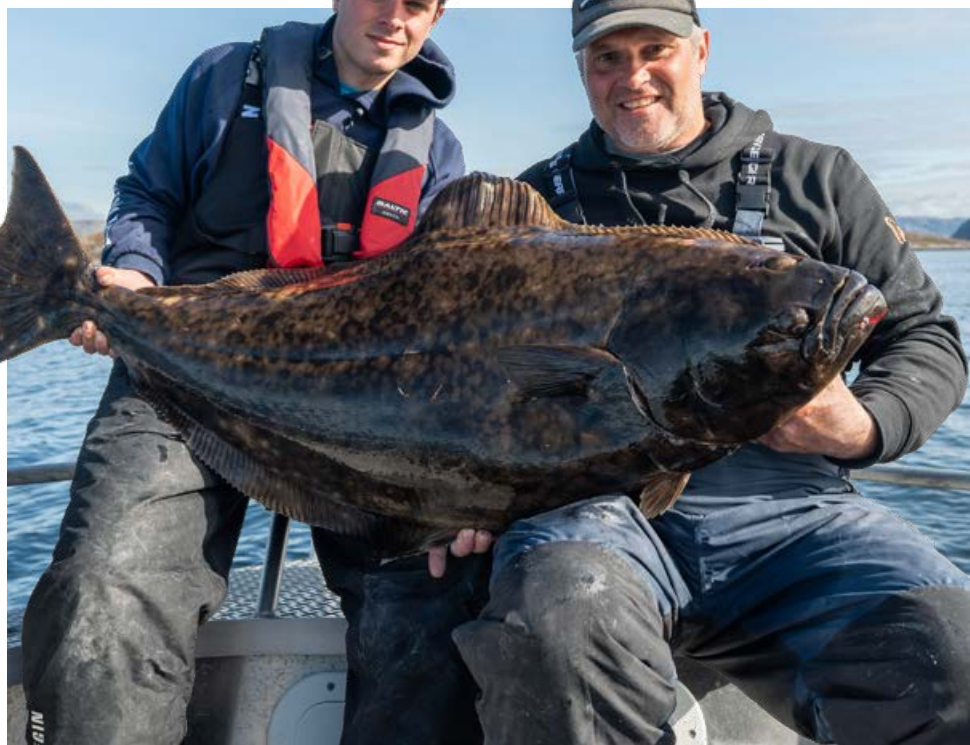
The travelling duo with one of the highlights of the trip.