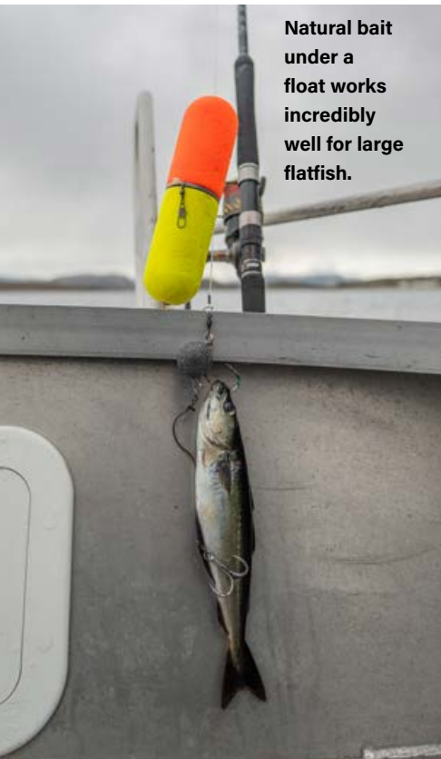
Natural bait under a float works incredibly well for large flatfish.