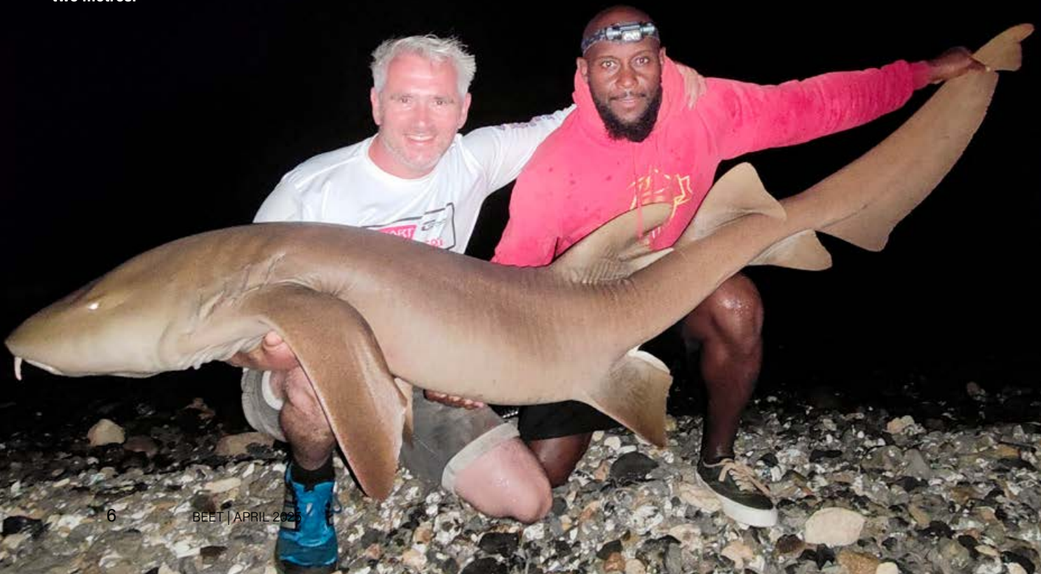
Nurse sharks that easily exceed two metres.