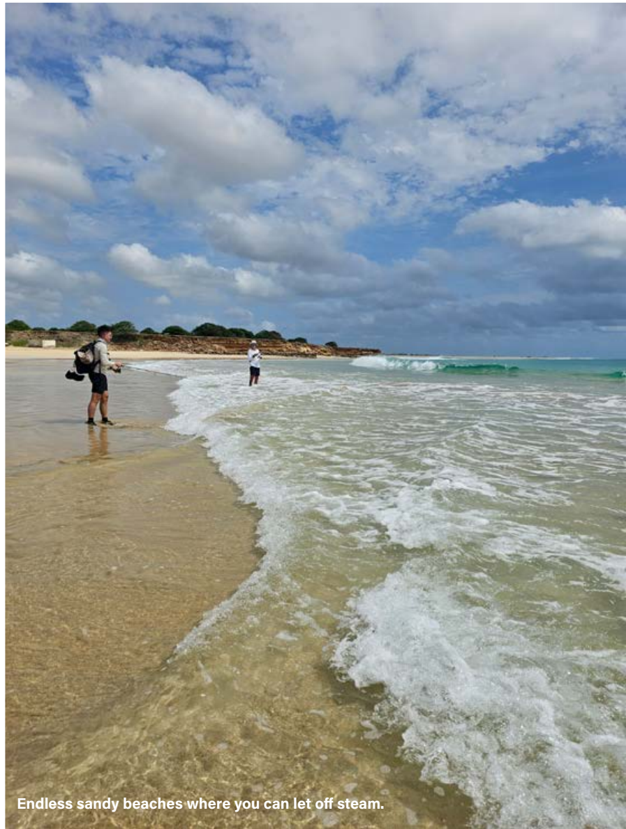
Endless sandy beaches where you can let off steam.

We use a large circle hook as our standard hook. A bite on the big rod guarantees excitement. Sam explains everything from A to Z. How to attach the bait, how and where to cast, how to place the rod in the support and what to do when there is a bite – we learn it all. At our request, we are also allowed to try these rods ourselves. It's not rocket science, but setting the hook does require some skills and experience. It doesn't work with every bite, but when the hook catches flesh, the adrenaline takes over completely. The heavy rods regularly bend. We mainly catch nurse sharks, but also lemon and blacktip sharks. The nurse sharks in particular are really big. Most of them easily exceed the 2-metre mark, with the largest of the trip measuring 230 cm. The bonus fish on these rods is mine. After casting, I put the rod back in the support and tighten the line slightly so that it doesn't get caught between the rocks on the shore. Before I can rejoin the barbecue that Sam has prepared for us, I get some taps on the tip. To be on the safe side, I stand by the rod. When the drag starts to rattle, I pick up the